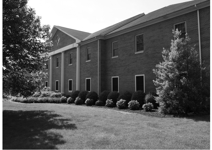
Holloway Dormitory for girls

If an alarm is activated, students should follow the instructions which will be displayed on each beacon and respond accordingly.