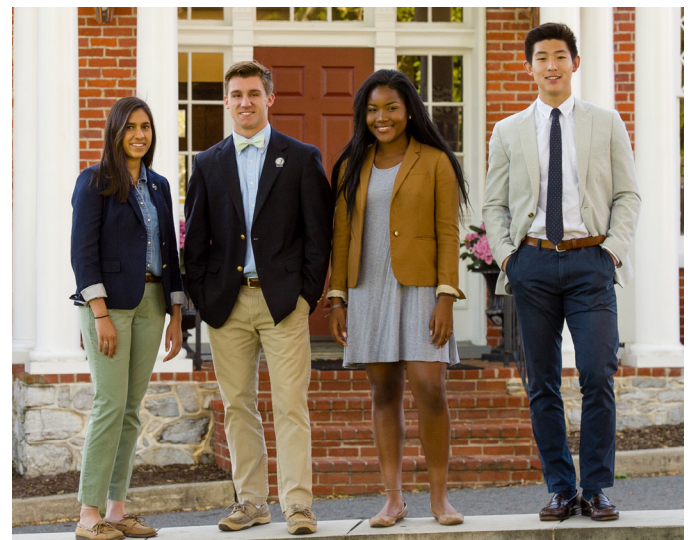
Formal school dress