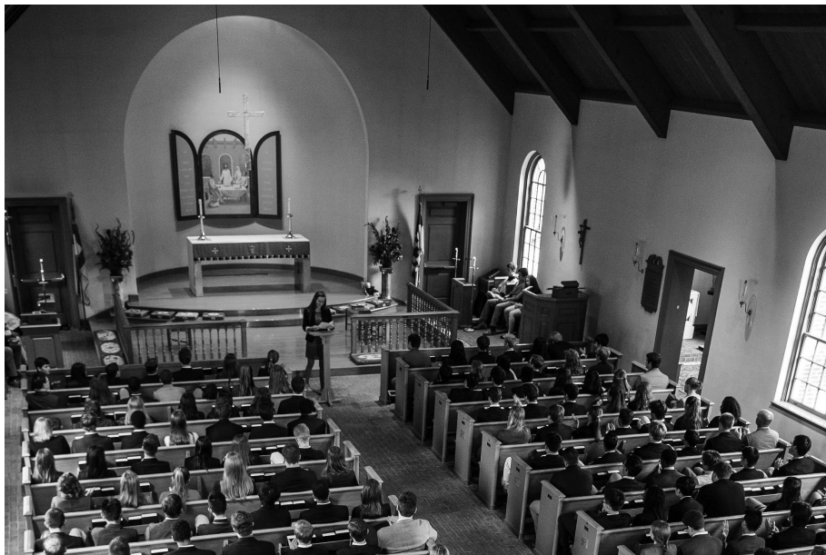
The Saint James Chapel

(680, The Hymnal 1982; The Episcopal Church)