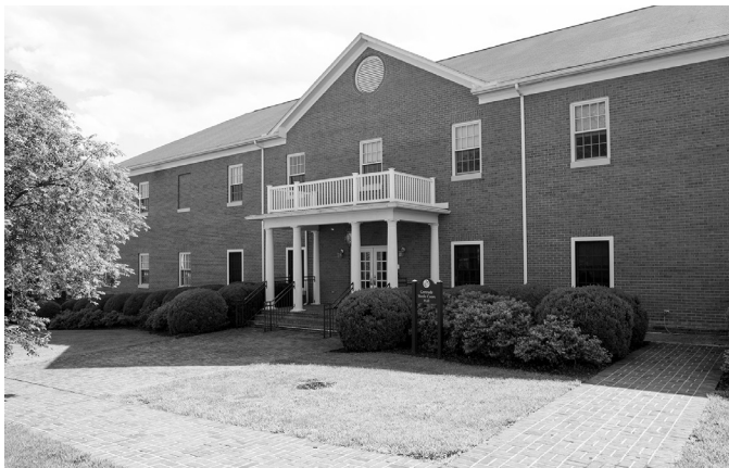
Coors Dormitory for girls

BOARDING STUDENTS must be on their halls Sunday through Thursday at 10:00 p.m.