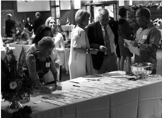
Members of the Parents' Association.

A wonderful way for Saint James School parents to show their gratitude and appreciation to teachers is by supporting the Annual Fund Campaign each year. Annual Fund gifts can be given "In Honor" of an individual teacher or administrator, and this special designation will appear in the School's Annual Report of Giving. Parents are discouraged from the practice of making monetary gifts to individual faculty members.