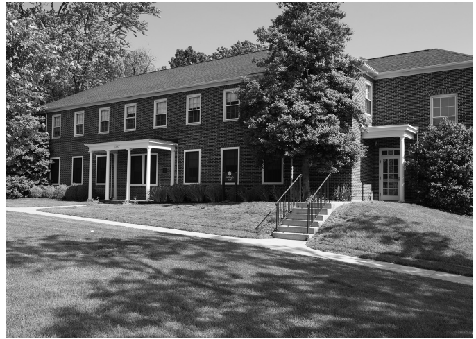
Mattingly Dormitory for boys