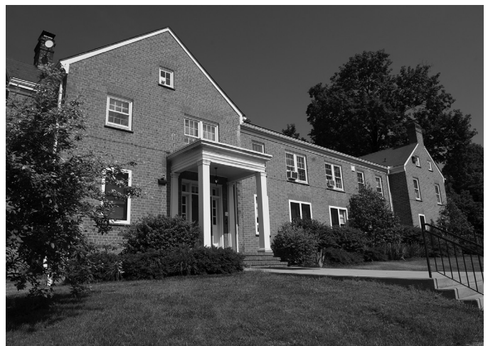
Onderdonk Dormitory for boys

Boarding students may not entertain visitors from off campus during the week (i.e., Sunday 6:00 p.m. through Friday 6:00 p.m.), but may do so with the Dean of Students' specific permission on weekends. They must ask for this permission in advance.