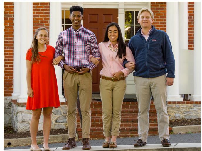
Modified school dress